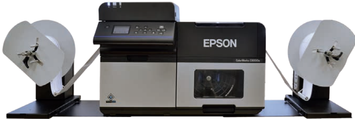
LABEL REWINDER (RW8000A) - Epson C8000 printer - LABEL UNWINDER (UW8000A) (Not included)

The Unwinding/Rewinding system for Epson C8000 Label Printer can handle media up to 127mm (5") wide and unwind/rewind label rolls having outside diameter up to 250mm (9.84").